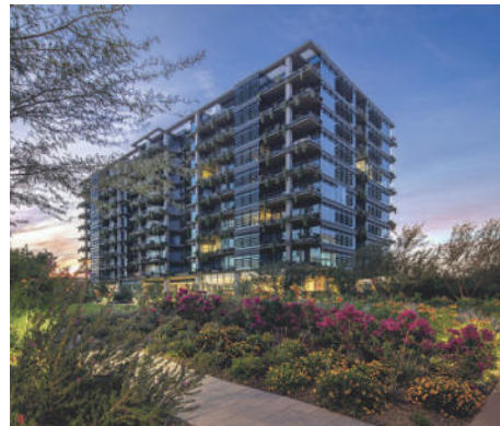
Bill Timmerman via Optima Kierland

Amenities include a rooftop Sky Deck with a heated lap pool, spa, outdoor theater and an indoor/outdoor yoga room. Ground-level amenities include indoor pickleball and basketball courts, a golf simulator, fitness center, theater room and party room with a chef's kitchen.